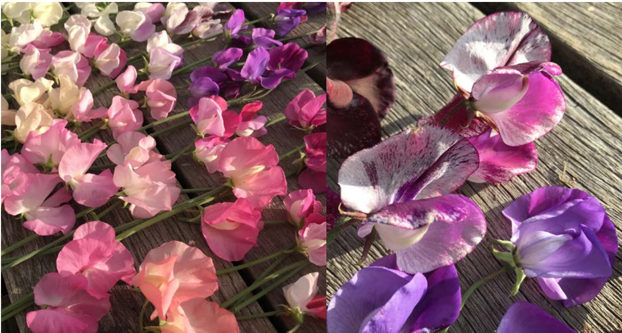
A selection of Sweet Peas this June including Gwendoline, Heaven Scent and Senator