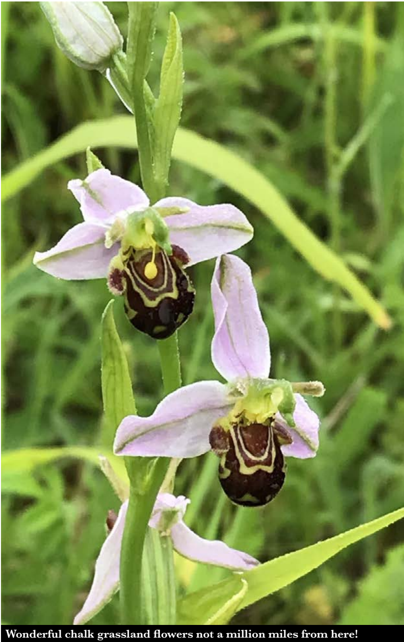
Wonderful chalk grassland flowers not a million miles from here!