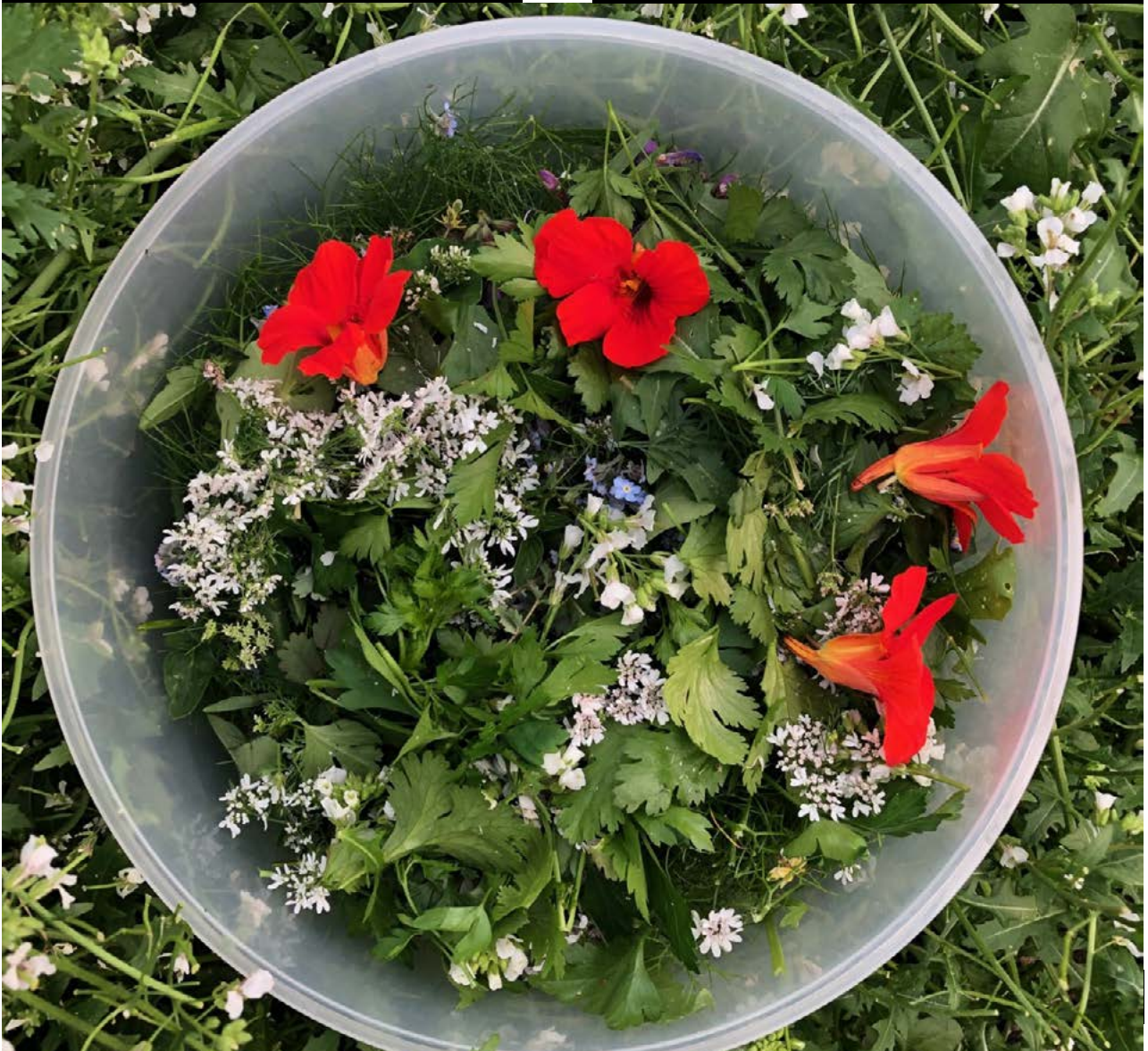
Lots of edible flowers around Coriander flowers, Forget-me-nots, Wasabi flowers and Nasturtiums