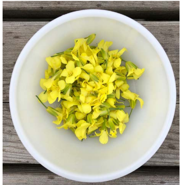
Purple Sprouting Broccoli flowers so sweet and tasty